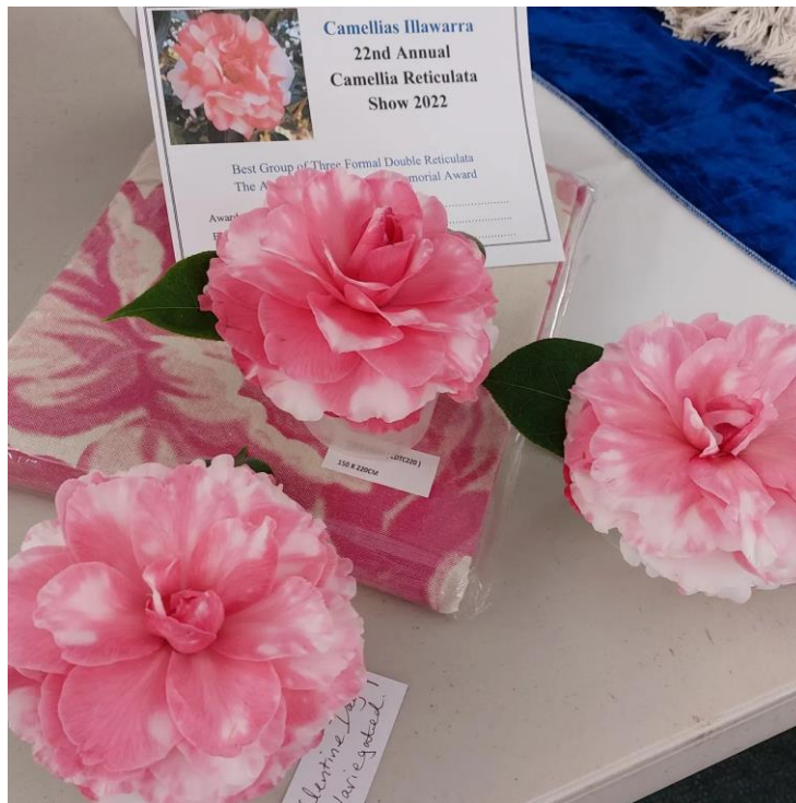
Champion Collection of Three