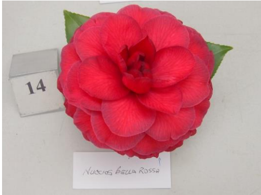
Nuccio's Bella Rosa