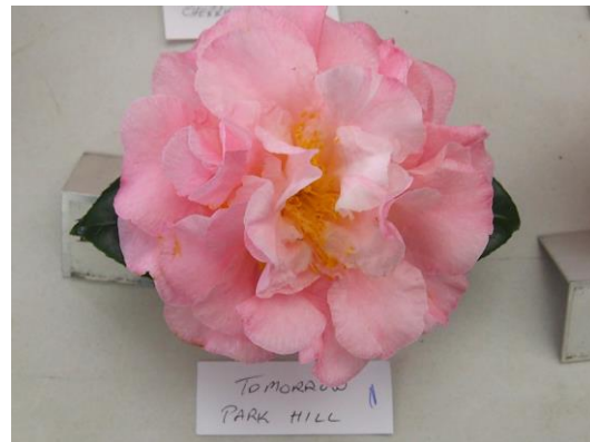
Tomorrow Park Hill