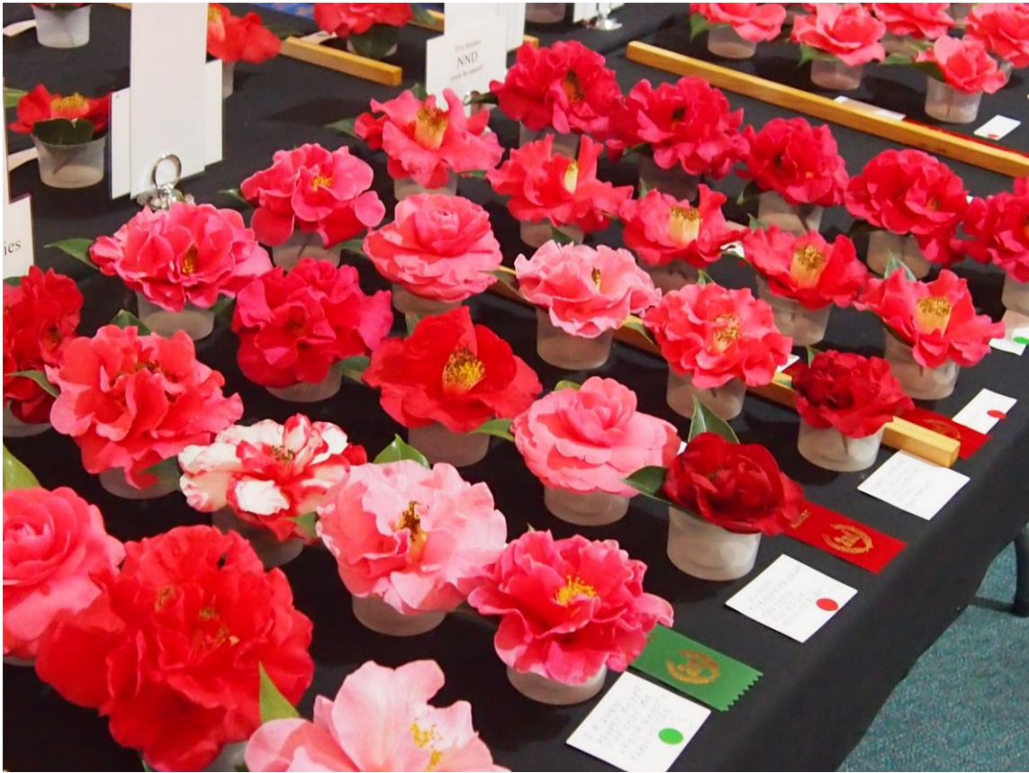
Beautiful Blooms from our 2018 Reticulata Show