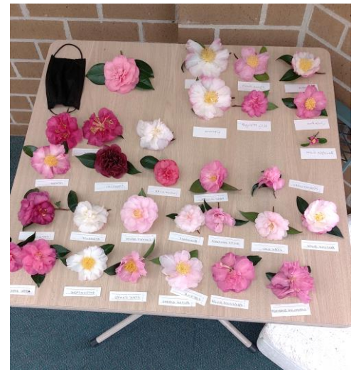
Our March Display

Thank you so much to all those who have helped....Well done!