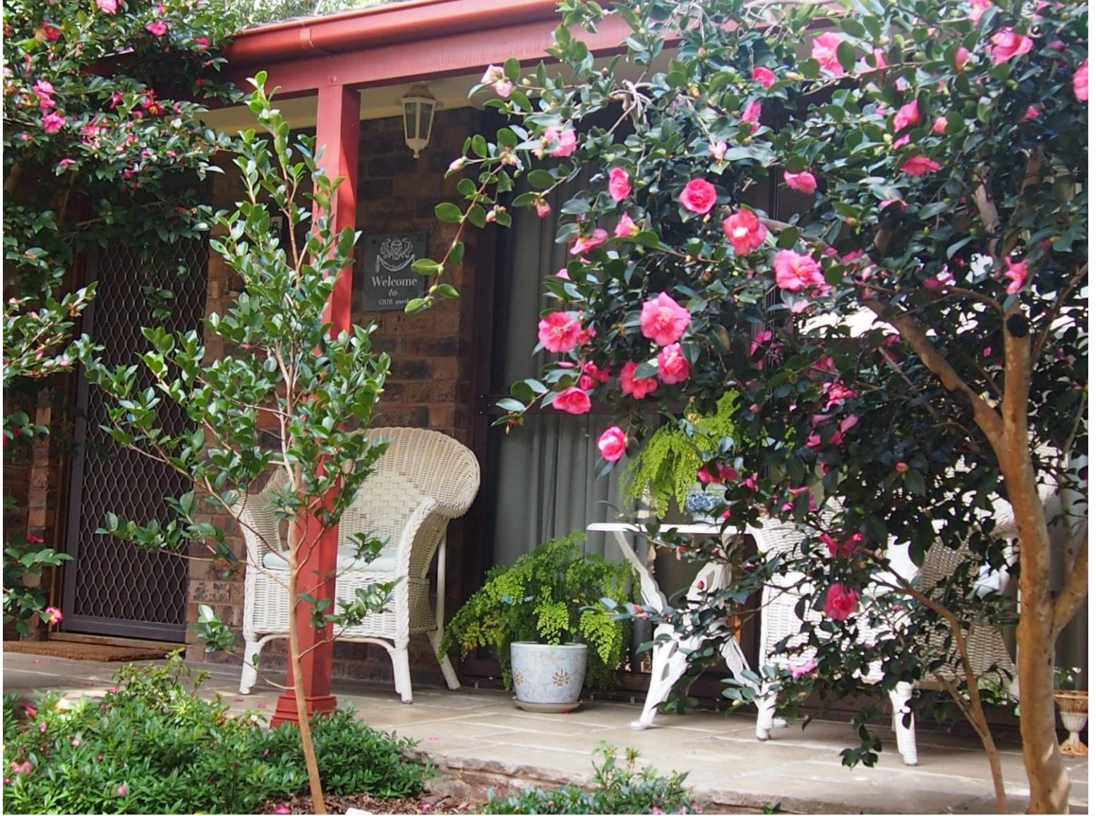
Camellia Sasanquas 'Hiryu' and 'Lucinda' at our front door.