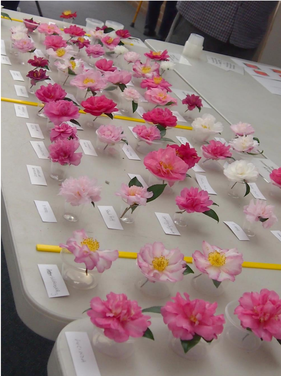
A photo from last year's Bloom Competition.